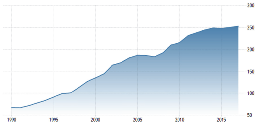
Figure (3) General Government Debt in Japan (1990-2017)

Source: https://tradingeconomics.com/japan/government-debt-to-gdp